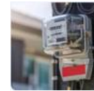
Centralized electricity meter reading